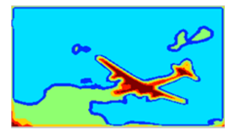
Figure 2: Segmented map image

Figure2 shows the segmentation maps. After resizing the input image using the fixed threshold value as show in the figure1, convert it into gray scale image. Then segmentation is performed on this gray scale image. Parts of the image having similar properties are grouped together and given a separate color for each group.