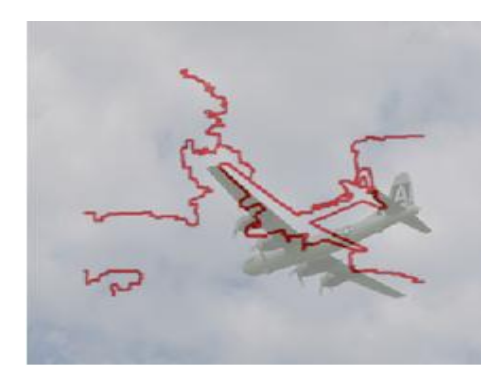
Figure 5: second round group image

Result of the first round perceptual organization. Notice that the different parts of the aeroplane have been grouped into two big pieces. These two big pieces are aligned. Bottom: final segmentation result after second round.